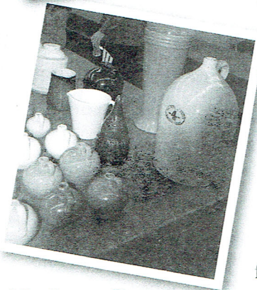
Miscellaneous Pictures From a Recent Sale