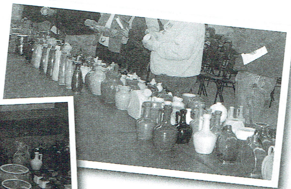
Miscellaneous Pictures From a Recent Sale